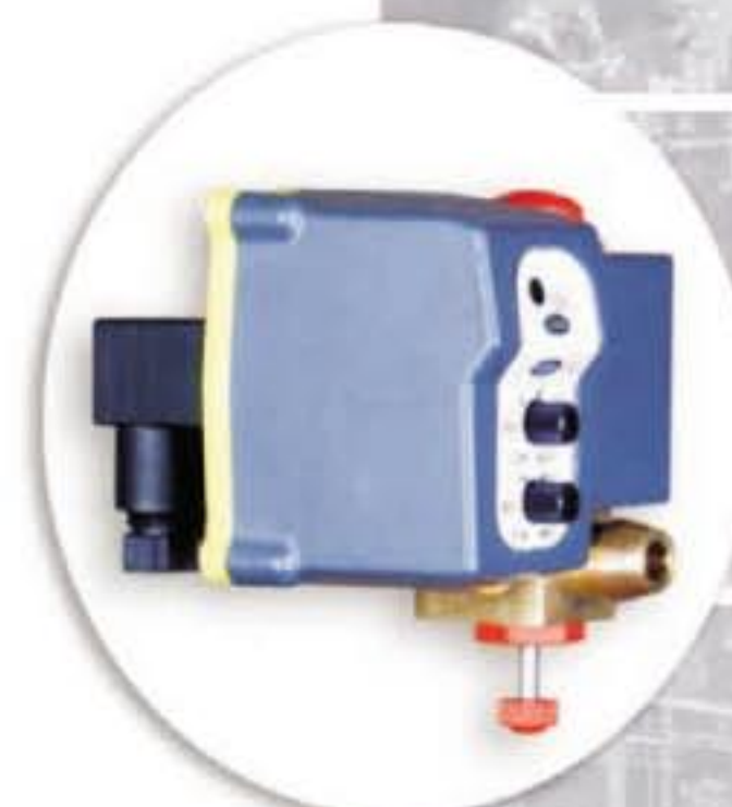
Optional - Auto drain Valve